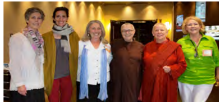
National Conference (Calgary, AB 2012)