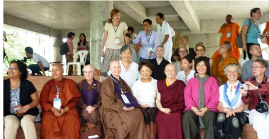
Sākyadhītā International Conference in Thailand

If you find a wise and clever friend Who leads a good and pure noble life, You should, overcoming all obstacles, Keep his company joyously and aware!