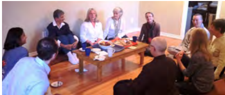
Volunteer Board Members of Sākyadhītā Canada

Sākyadhītā Canada is an alliance of women dedicated to establishing connections and developing relationships between Buddhist laywomen and monastics.