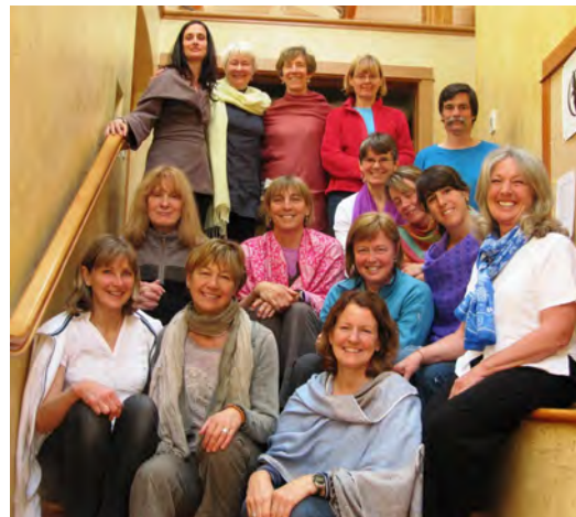
Fund-raising Retreat (Salt Spring Island, BC 2011)